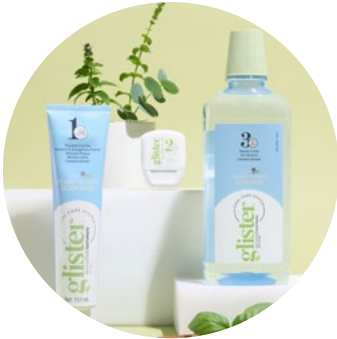
Simple, 3-step routine