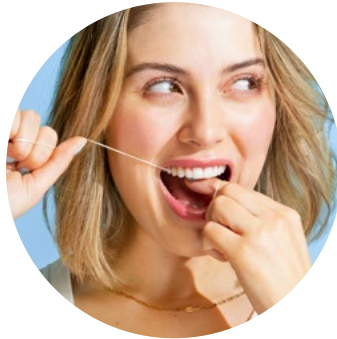
Won't disrupt the oral microbiome