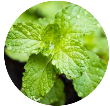
Flavored with Nutrilite™-certified peppermint *